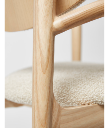
Karina with Arms shown in Clear Ash Frame