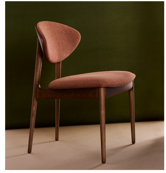
Karina Armless shown in Nutmeg Ash Frame