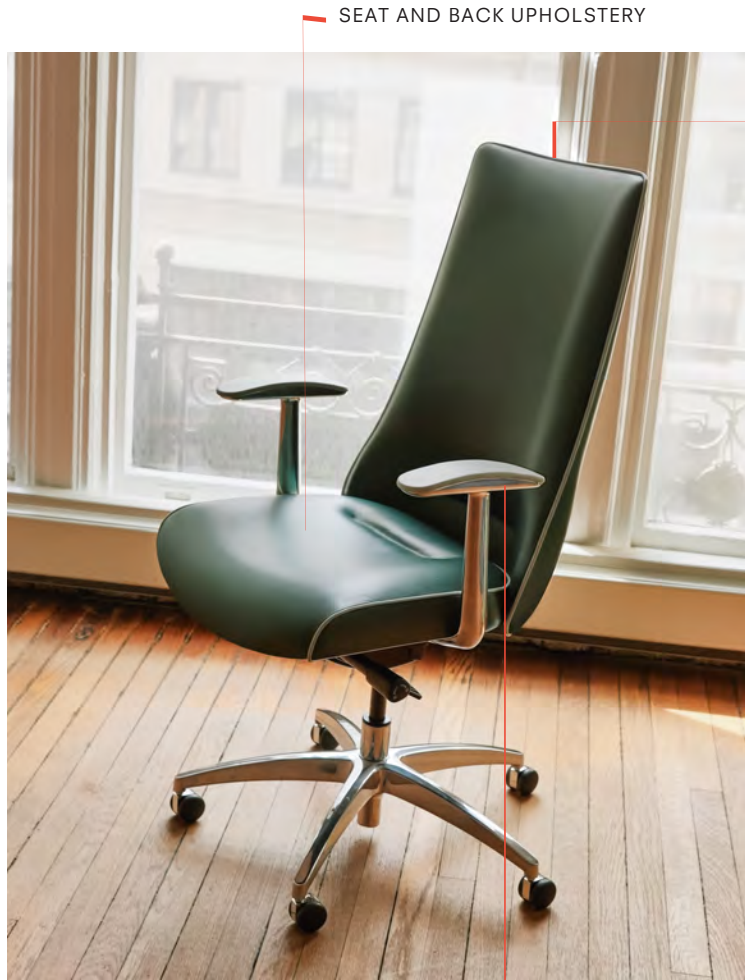
SEAT AND BACK UPHOLSTERY