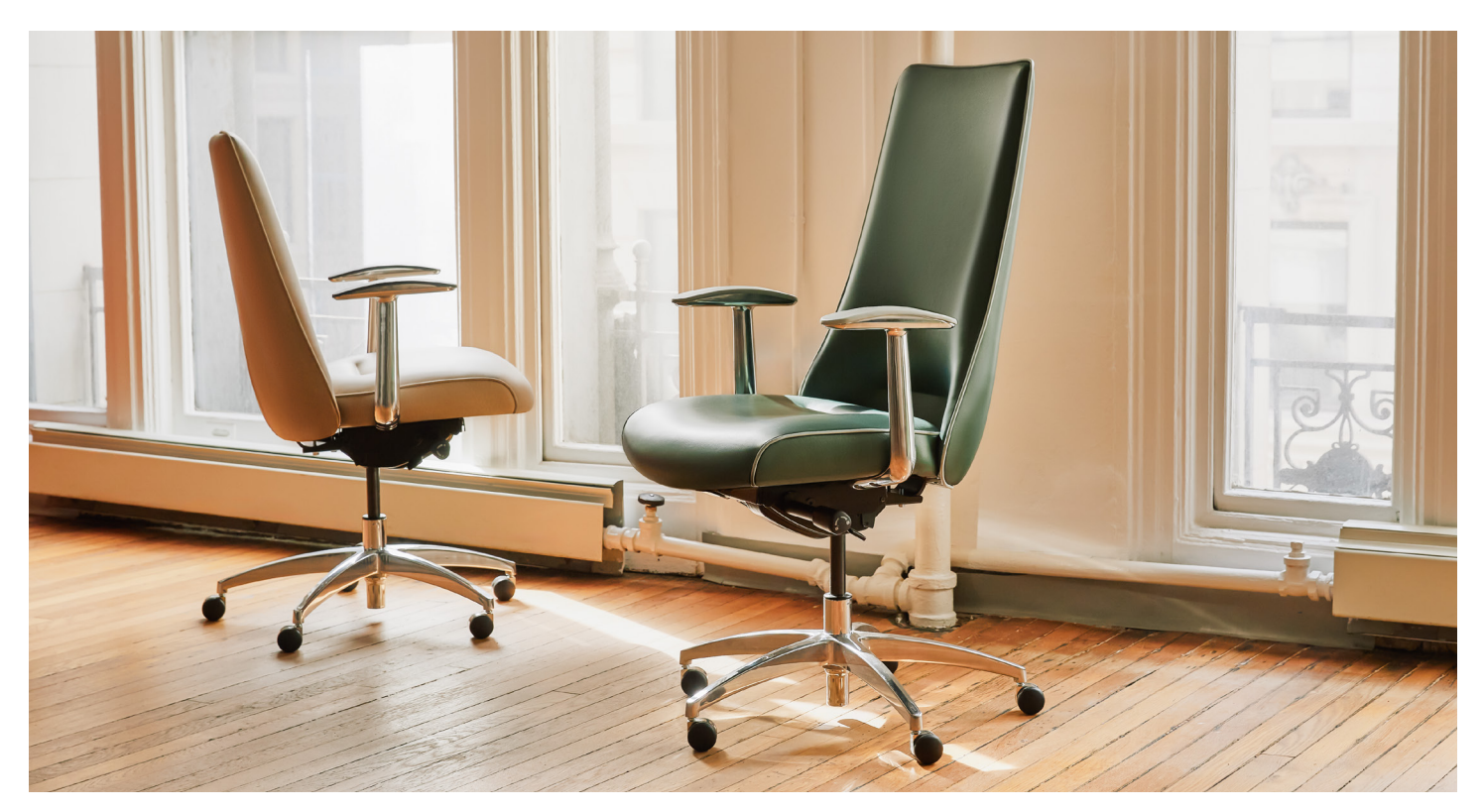
Dove Mid Back and High Back Group