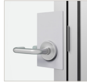
Mortise Lever, Title 24

All pull hardware is available in black or silver, with passage and locking options.