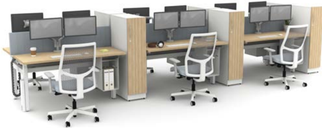
Empower® Workstations, Contain® & Fuse™ Storage, and Ignition® 2.0 ReActiv® Back Chairs

Police Stations demand a diplomatic balance of discreet private stations and collaborative open areas that offer smart, streamlined workflow and customized connection.