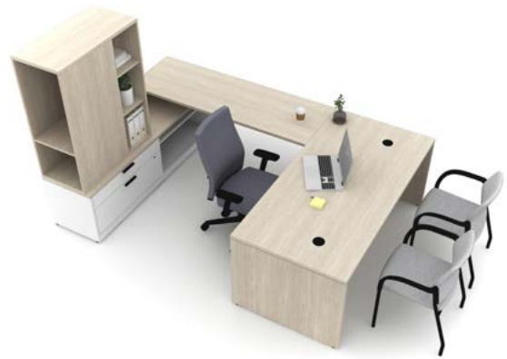
10500 Series™ Desk and Ignition® 2.0 Chairs

With Private Office layouts, one size never fits all- but to be productive, a workspace needs to be designed for you whether you're making an important phone call or working with your head down.