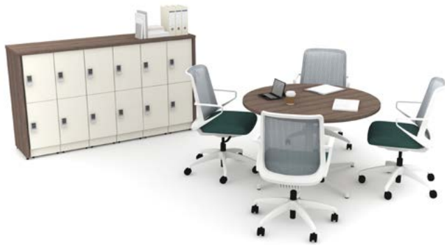
Preside® Table, Cliq™ Chairs, Contain® Lockers and Storage Islands

Whether it's a policy-making mission or one-on-one collaboration, sensible shared environments require highly functional seating and worksurfaces designed to support big decisions and shared goals.