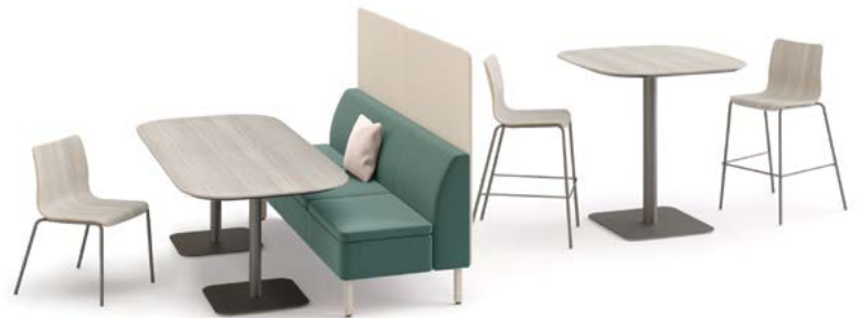
Astir™ Lounge, Ruck™ Chairs, and Birk™ Tables

Breathable environments with natural light, pops of color, and solutions designed to administer comfort and support make all the difference in a busy workday.