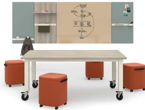
Preside® Table, Astir™ Poufs, and Workwall

With laws and standards constantly in flux, it is important for law enforcement agencies to regularly review and update their policies and procedures, as well as their training practices, to ensure the safety and effectiveness of their officers.