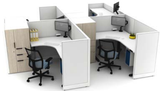
Accelerate® Workstations, Voi® Storage, and Ignition® 2.0 ReActiv® Back Chairs

Everyone deserves a safe, comfortable space to work without interruption, making individual workstations a key space in Police Headquarters.