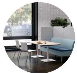
Break Room Spaces