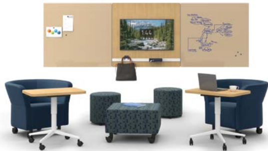
Huddle Tables, Flock® Seating, and Workwall

Studies reveal a 73% increase in the meeting room demand within flexible spaces. Using a dedicated working space is a critical professional move, providing the perfect backdrop to take vital business decisions. 2