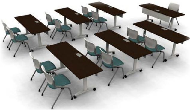
Huddle Tables, and Motivate® Chairs

To create effective training practices, it's important to incorporate engaging and energetic training rooms that offer instant mobility, all-encompassing comfort, and straightforward design and functionality.