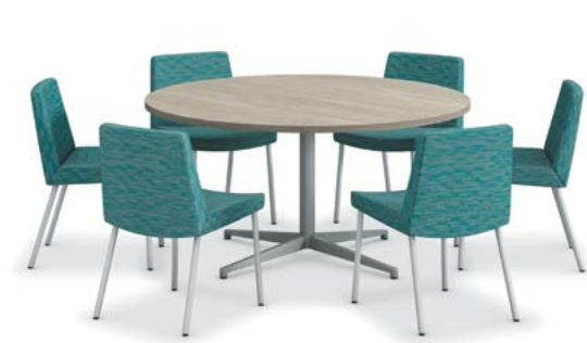
Flock® Seating and Preside® Table

Diligent, heads-down focus is imperative to highly productive government spaces, but everyone – no matter how conscientious – needs a break occasionally.