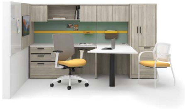
10500 Series™ Desk, Workwall, Solve® Chair, and Ignition® 2.0 ReActiv® Back Chair

Discretion and functionality are two of the most important attributes of a solitary space – these environments deserve solutions designed for fine-tuned focus, comprehensive organization, and reliable privacy.