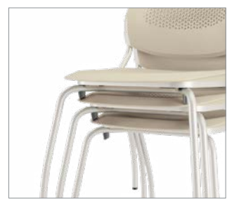
Multi-purpose chairs can be stacked up to five high and stored when not in use.