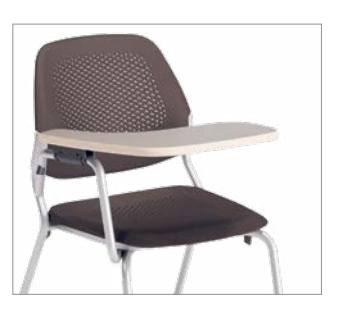
Optional flip-and-fold tablet arm offers a functional worksurface.