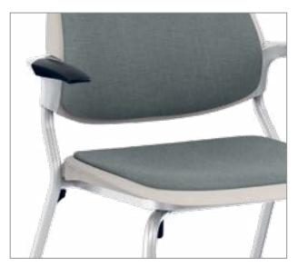
Add arms and seat or back cushions for design versatility and comfort.