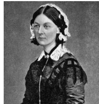
Florence Nightingale, circa 1850

Answer :D. Flo took an avid interest in the progress of student nurses. She adamantly believed that nursing was the work of God. However, professional non-secular nurses had been unleashed and she was worried about the increasing use of the word "profession" in nursing and that advances such as examinations would test only knowledge, but not the essence of nursing.