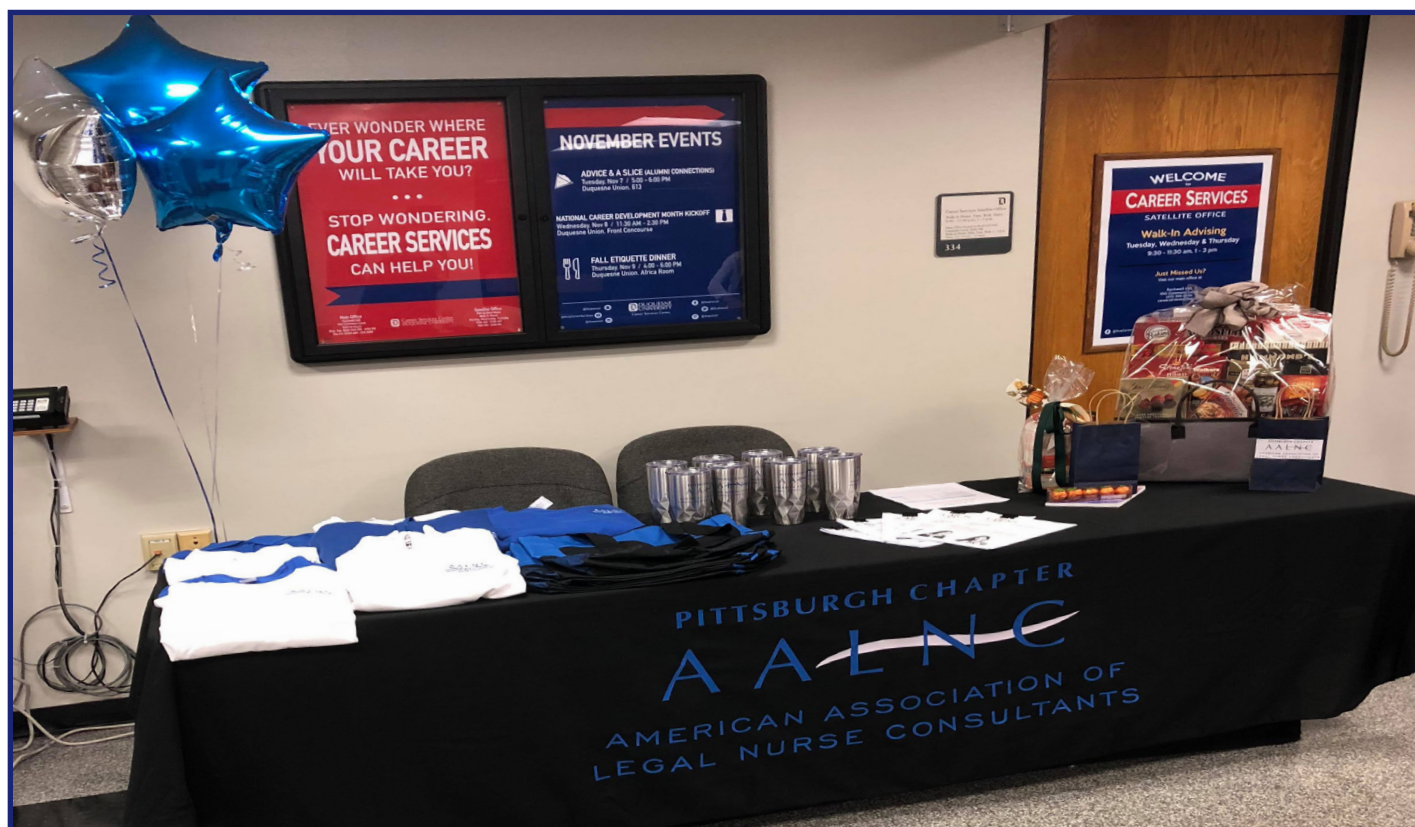
Official Publication of the Pittsburgh Chapter of the American Association of Legal Nurse Consultants