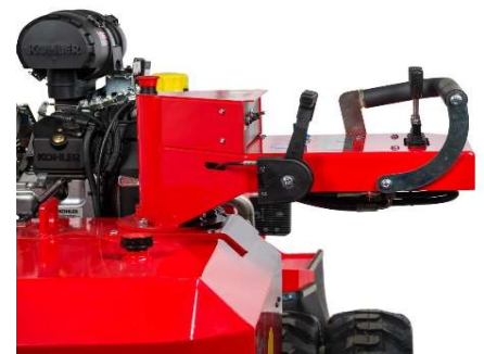
Turnable control panel