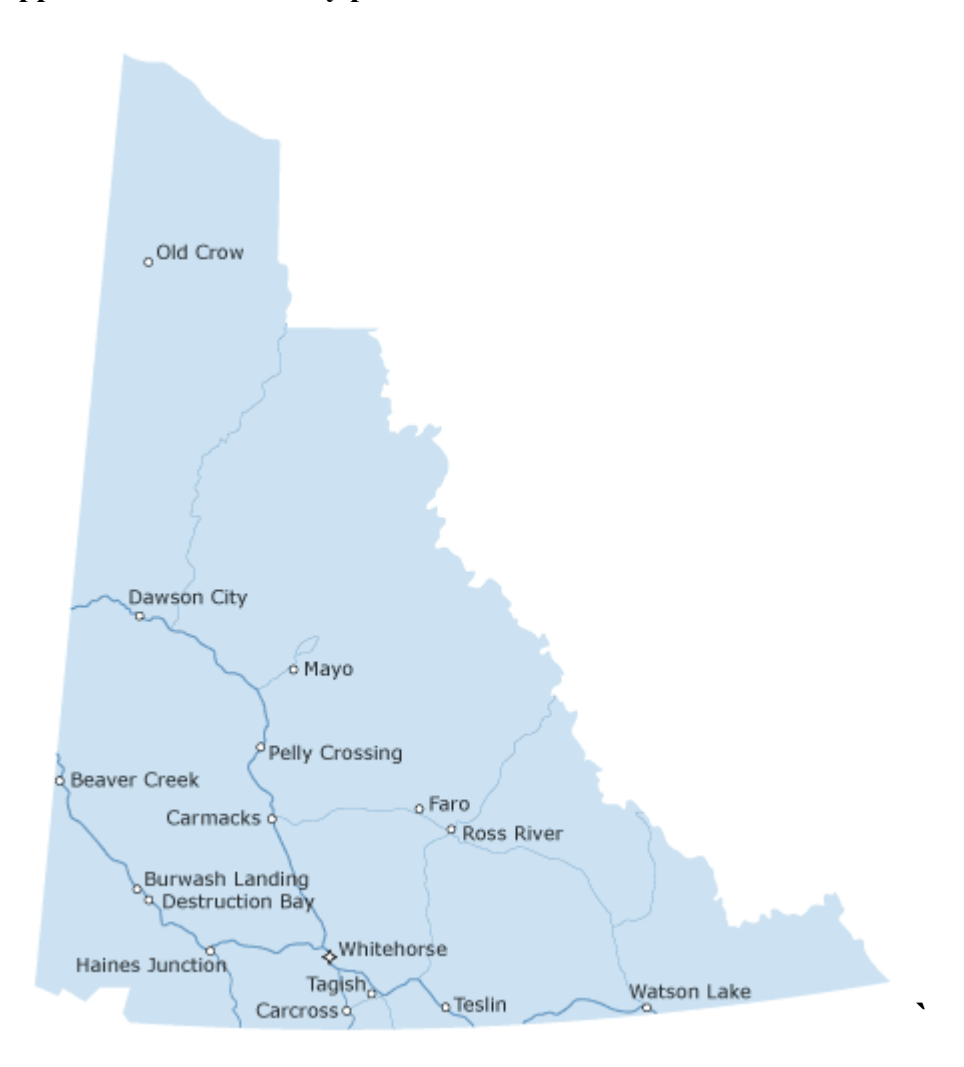
Appendix C: Community profiles <sup>70</sup>