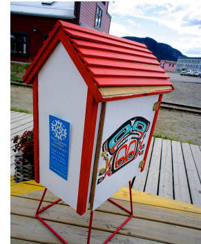
Little Library in Carcross

Our Little Library project has been very successful. Little Libraries are operational in Mayo, Old Crow, Dawson City, Whitehorse, Carcross, and Tagish. We have community members working to install them in Burwash Landing, Beaver Creek, Marsh Lake, Teslin, Pelly Crossing, Faro, Ross River and Kwanlin Dun. The libraries are decorated boxes built to free-stand somewhere prominently outside in the centre of a community, and be a place where books can be donated and borrowed at the will of the community members and tourists alike.