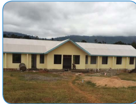
New maternity ward (left); old maternity room (below)

Because Karimu regards it as a tragedy when people have no access to life's most basic need, this year we are determined to help the residents of Gadgel. This village, which is adjacent to Dareda, has only one well that must be tapped by a single, outdated, rapidly failing hand pump.