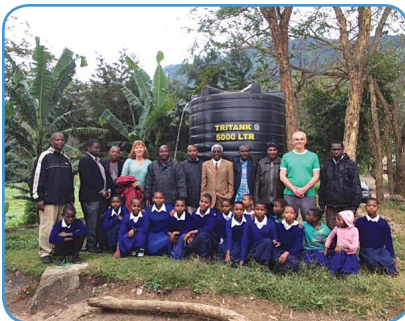
Completed Water Project, Bacho Primary School (above); Gadgel water pump in need of repair (right); Gadgel children carrying water to school (far right)