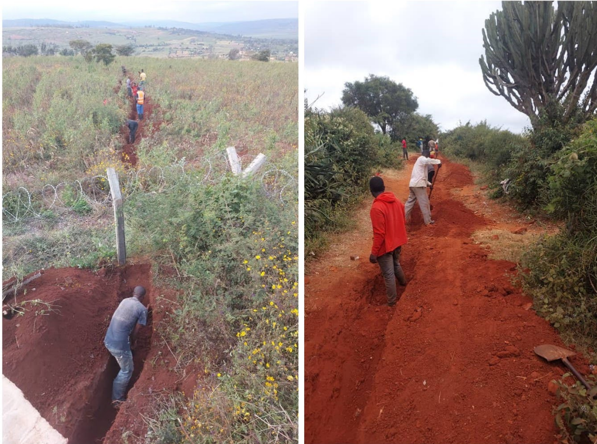
Managha Community preparing the trenches for underground pipes for the public water points.

The Arri water committee has been trained and is operating. We incorporated some previously existing water infrastructure that had many maintenance issues. The committee has itemized them and is currently addressing those issues. We expect to inaugurate the project this summer at which time we will have the Arri water system maintenance integrated into our online dashboard .