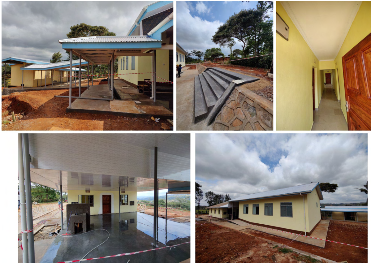
Tsaayo dispensary building construction underway. Upper left: the community clears the field and digs the foundation, upper right: the foundation is laid; lower left: cement block walls are going up; lower right, completed exterior construction with roof and plastering.

Besides construction, as you know, we execute health interventions that follow the World Health Organization's medical protocols which, when followed well, significantly improve the quality of health services. We run such health interventions simultaneously in Arri and Ayalagaya and they are continuing as planned. We completed the 2nd quarter TB campaign . Fingers-crossed: we saw a lower percent positive and we are hoping this is the beginning of a downward trend. Each TB campaign cycle, in addition to our service areas, we invite the government to name 2 additional villages outside our service area, but nearby, to include in the awareness campaign. This cycle we provided outreach to Dabil and Kiruu.