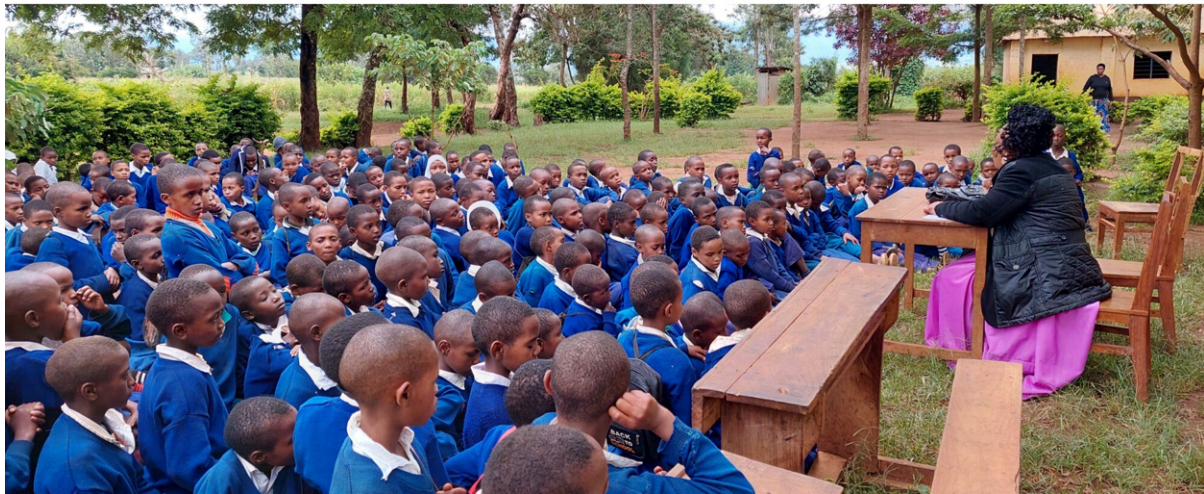
Local leader meets with parents and students of Tsaayo Primary

On the construction side, we are almost done with the new buildings with 3 classrooms and 1 office at Gajla and Haysam Primary School.