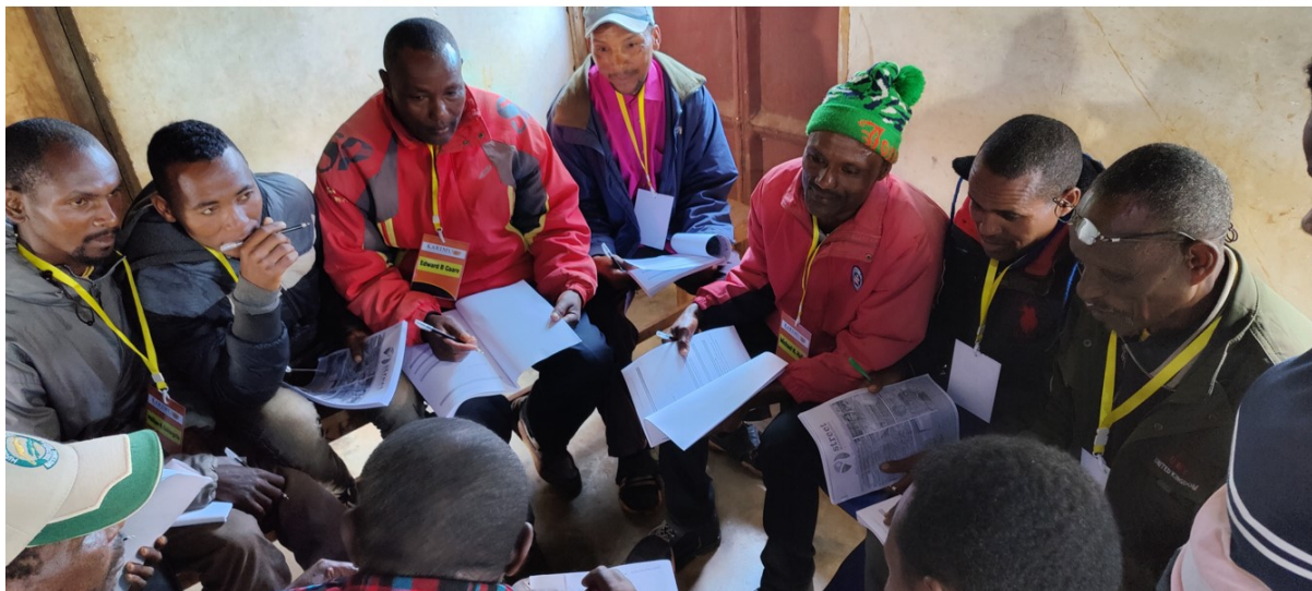
Participants in the Entrepreneurship class take in and discuss the material

Our savings group training has picked up again after training 2 new field officers (who, in turn, train the savings groups). We anticipate the graduation of the first groups in Arri ward this summer, hopefully while I am here and can congratulate them in person. We have loaned $49,458 to the graduated savings groups through our Financial Assistance project from 2021 to present and we have yet to have had a late or missed payment!