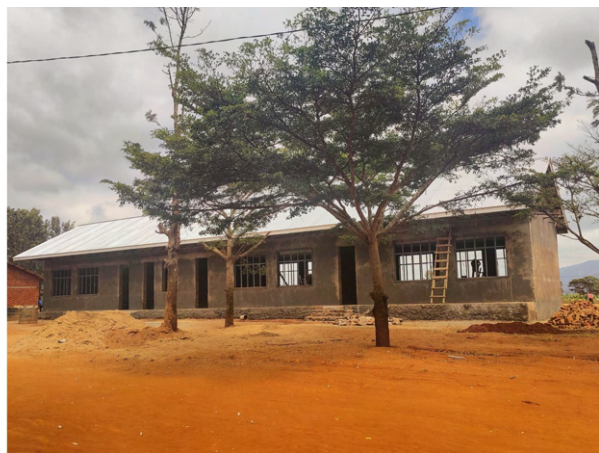
Current progress on Gajla classrooms (left) and Haysam classrooms (right)

We raised enough funds to complete 3 such buildings this year. We plan to start the building in Dareda Kati Primary school once the volunteers leave Tanzania. As I mentioned in my previous email, when we complete these 9 classrooms, we will have built 70 out of the 92 classrooms needed across all schools in Ayalagaya.