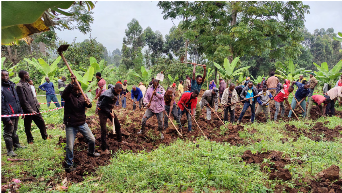
Bacho community digging the foundation for the new kitchen

The construction of the kitchens and the additional classrooms are the only remaining projects to complete our education program in Ayalagaya. These are the projects we delayed until 2024 because we did not reach our fundraising goal.