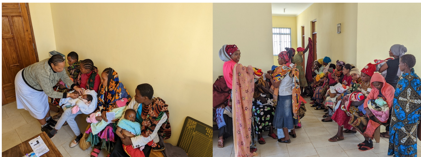
Vaccination day at the new Reproductive and Children's Health building.