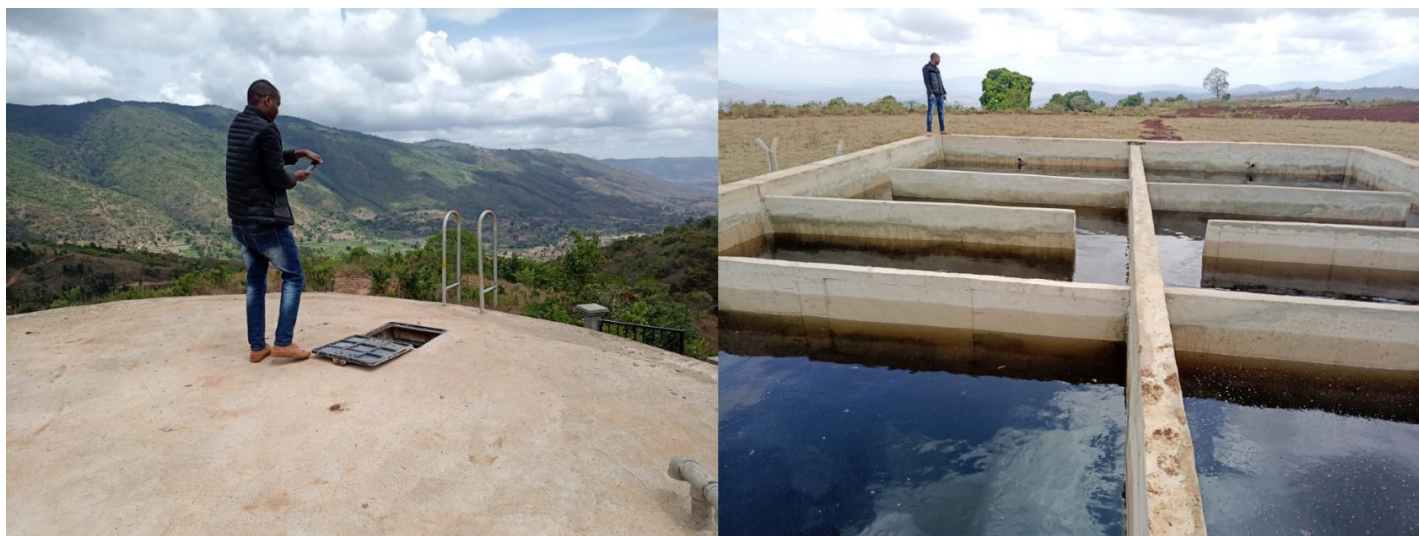
Dohom A distributions water tank full of water on the left and sedimentation tank on the right