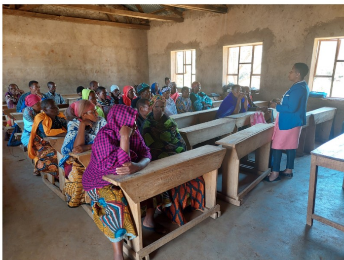
Clockwise from upper left: The completed Special Needs Children's Hostel, new Gajal Primary classroom block, parent meeting on the importance of education, student meeting on the importance of education