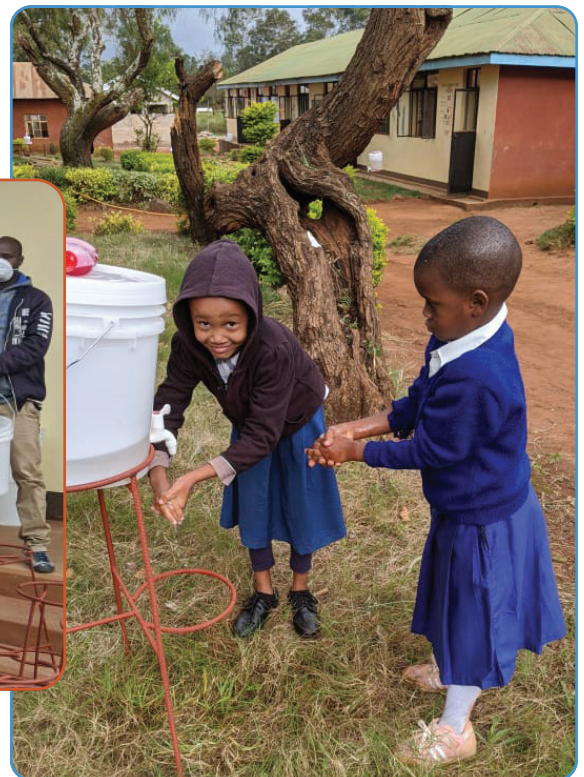
RIGHT: Students washing hands