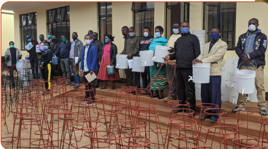
ABOVE: Teachers receiving sanitation supplies