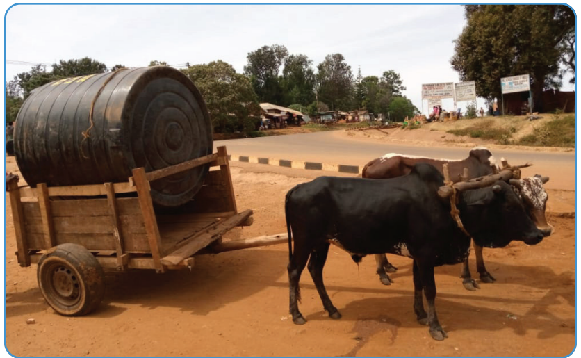
Bringing water to remote areas

As soon as it is safe, Karimu will return to Tanzania to embrace the remarkable Kaheso employees whom we've been able to contact only electronically for months.