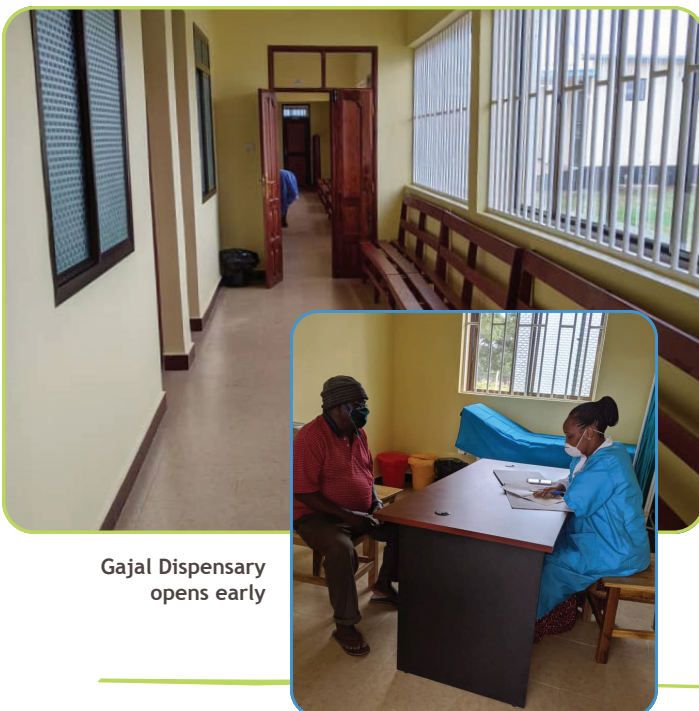
Gaja Dispensary opens early