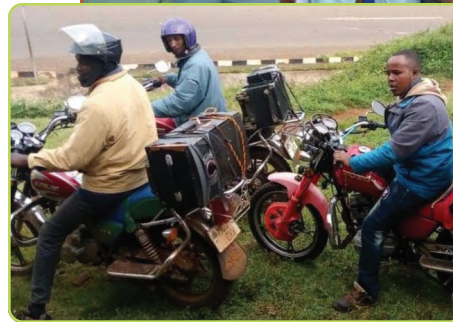
LEFT: Spreading the word about COVID-19