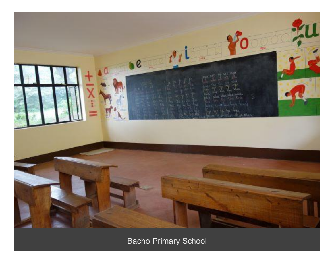
Helping school-age children reach their highest potential (total cost of $140,000)

Ayalagaya Ward has 5 primary schools and one secondary school. Children who seek further education must go to Dareda Mission High School, which lies 18 km away. This distance can hardly be covered on foot 5 days a week, and several students are forced to look for accommodation in Dareda Mission. Not all families are able to pay for housing and food on top of school fees, uniforms, and school material. As a consequence, less than half of the secondary students continue their further education. To help all school-age children reach their highest potential, Karimu will expand Ayalagaya Secondary School into a high school. The government is supportive of the effort and committed to provide the teachers. As this project involves simultaneous construction works and high demand for funding, we decided to split it in two stages. In 2020 we intend to complete the first stage, which encompasses