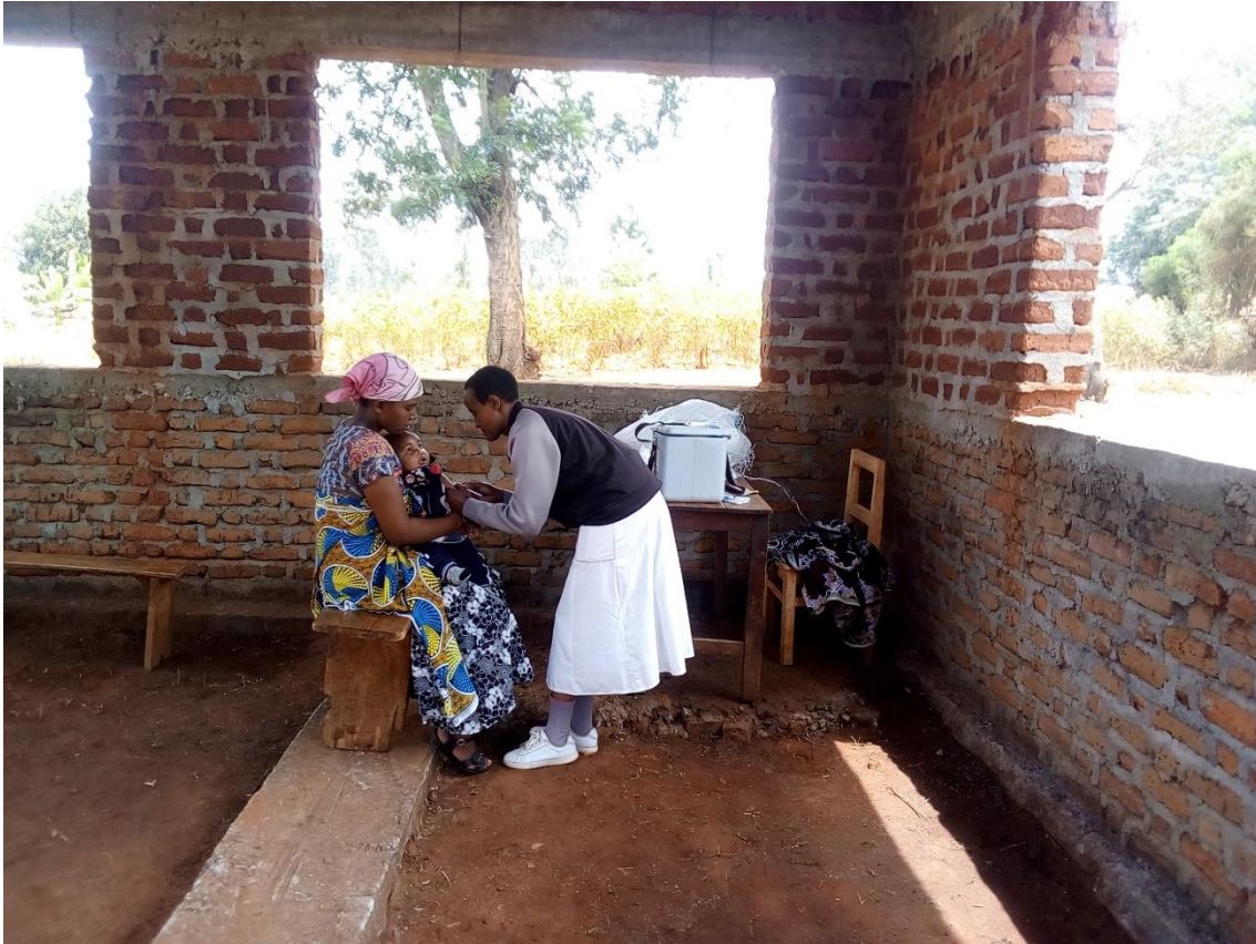
Location where the Gajal villagers are currently treated – they need a real dispensary!