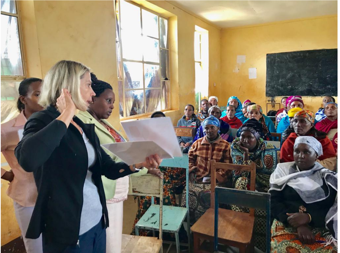
June - donation of over 500 pairs of shoes and 500 articles of clothing for the poorest children; donation of pressure cuffs, stethoscopes, fetoscopes, ear gloves among other supplies to the Dareda Kati Clinic and the 2 other health centers; donation of school material for all Ayalagaya and Arri schools