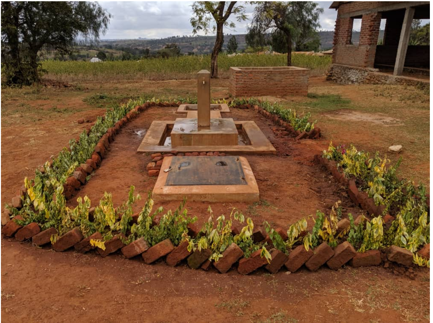
The icing on the cake - Karimu projects were highlighted on TV and newspapers across Tanzania and presented as a role model to be followed