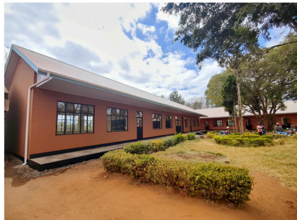
Clockwise from upper left: Patients line up at Tsaayo Dispensary, The community celebrates the opening of the Arri Primary School kitchen, Gajal Primary's new classrooms, Lunch being served from Bacho's new kitchen