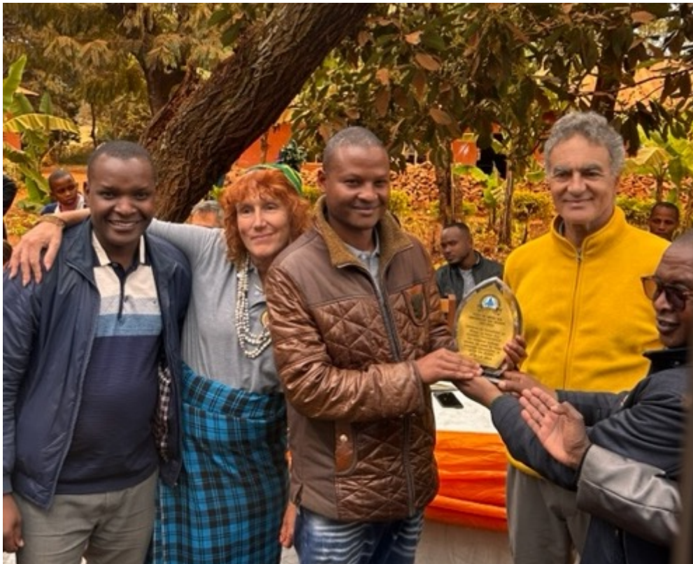
Karimu receives recognition from the District Government