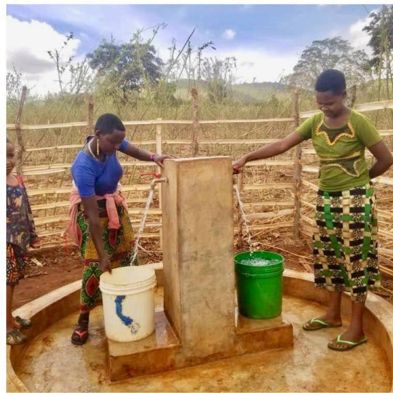
Community using the newly inaugurated water project in Arri