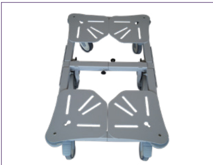
length and width adjustable

Groom® facilitates pushing and pulling carts up to 880 lb. Significantly reducing the effort required, it reduces the emergence of MSDs.