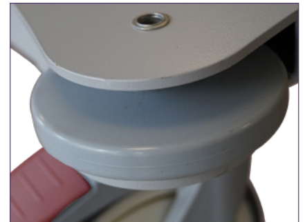
Shock-absorbing rubber guide