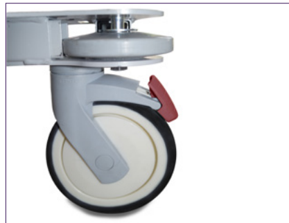
Dust cover wheel