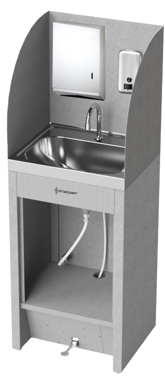
*Mains Fed Model shown with optional accessories

eg.: for specification and ordering quote Code: SPPL.WB.MSSC.G.TSD