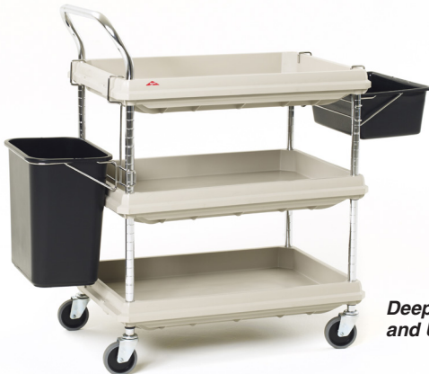
Deep Ledge Series with Wastebasket and Utility Bin Accessories