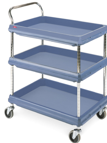
Deep Ledge Cart (3-shelf)