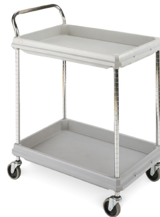
Deep Ledge Cart (2-shelf)