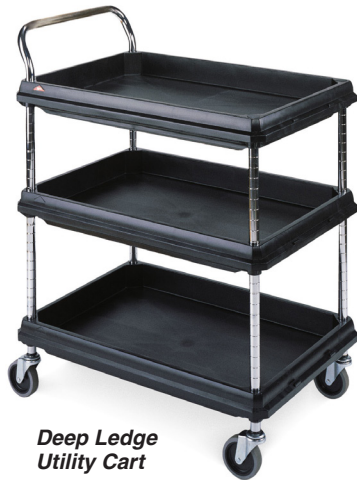
Deep Ledge Utility Cart