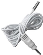
Temperature sensor ( 1 pcs )