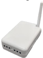
4G module ( 1 pcs )