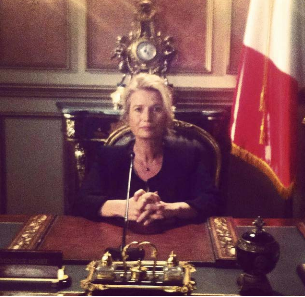
French Foreign Minister Dominique Roget