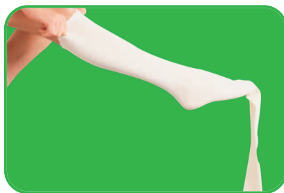
2. Pull Tubigrip onto limb like a stocking.