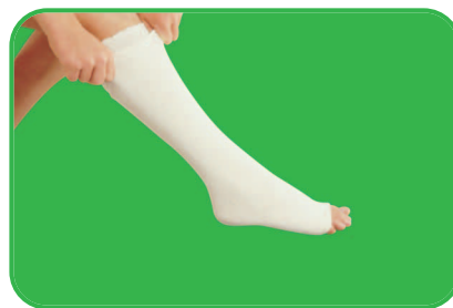
3. Double Tubigrip back over limb. Ensure upper edge is taken 2–3cm higher up the limb than the first.