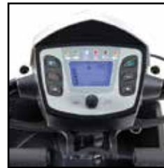
Digital LCD dashboard display