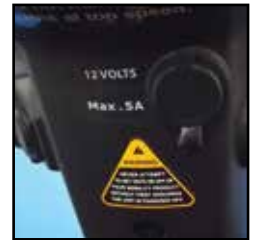
Handy 12 volt socket