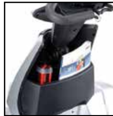
More space for storage