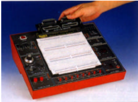
RESERVE FIXED HOLDERS: It can be ideally suitable for various connectors.

8pcs toggle switches and corresponding output point. When switch is set at "down" position, the output is LO level; contrarily, it is to be HI level while setting at "up" position.