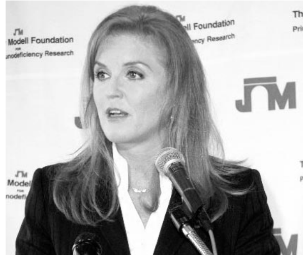
The Duchess of York addressing the media at New York press conference.

Network affiliates in all of America's major markets requested the PSA, which was produced by the Disney Company and features the Duchess of York. It was carried by 14 ABC affiliates, 16 CBS affiliates, 9 NBC affiliates, and 13 Fox affiliates. If you would like to view the PSA, please visit the JMF website at www.jmfworld.org and click on NPI. ♦