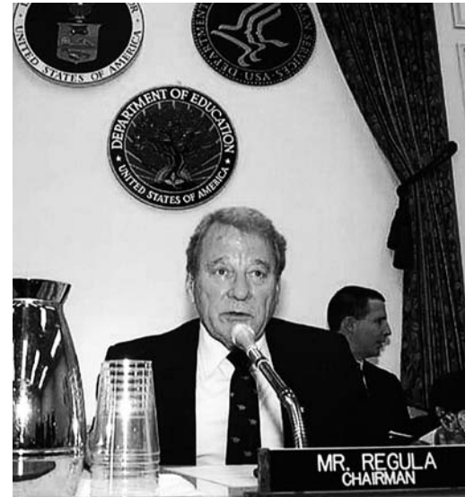
Congressman Ralph Regula (Ohio), Chairman House Appropriations Subcommittee on Health, at Congressional Hearings on PI.