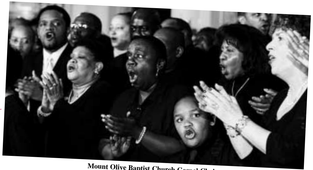
Mount Olive Baptist Church Gospel Choir