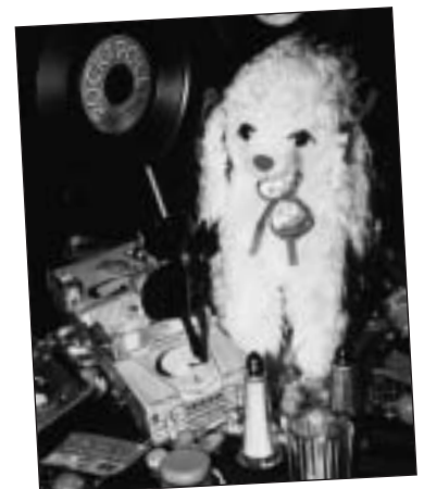
Rock & Roll memories dress the tables