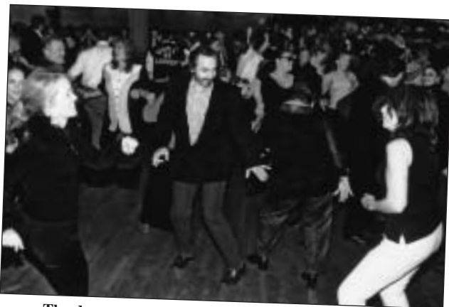
The dance party had everyone up and on their feet!