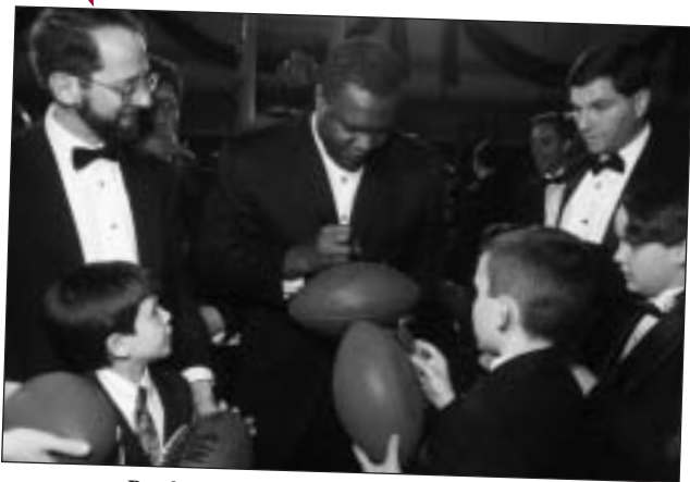
Pro-football star Rodney Peete signs footballs