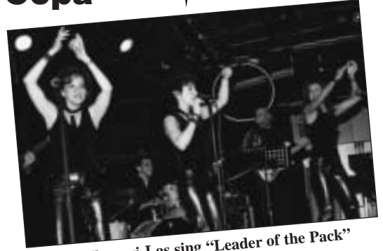
The Shangri-Las sing "Leader of the Pack"