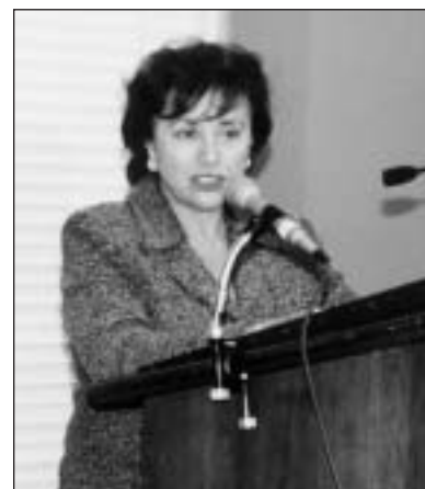
Representative Nita Lowey (D-NY) describes the government collaboration with the JMF