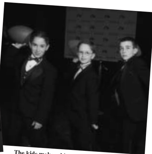
The kids make a big play for good health