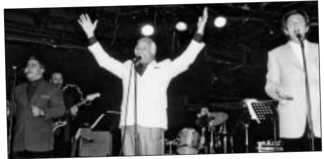
The Tokens sing "Lion Sleeps Tonight"