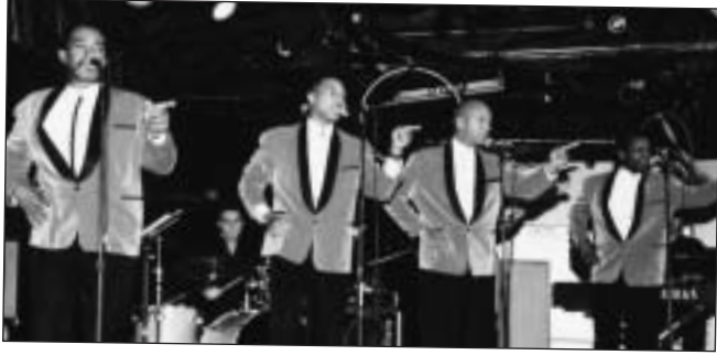
The fabulous Coasters sing "Charlie Brown" at the Doo-Wop Party