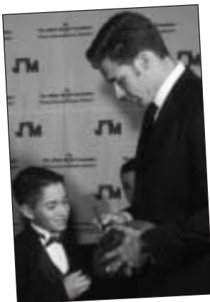
New York Giant Jason Sehorn signing footballs