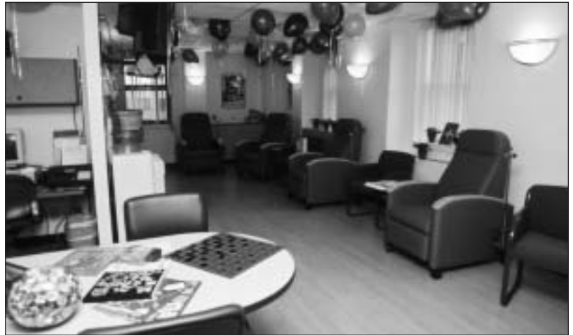
The new infusion facility "ready to go"