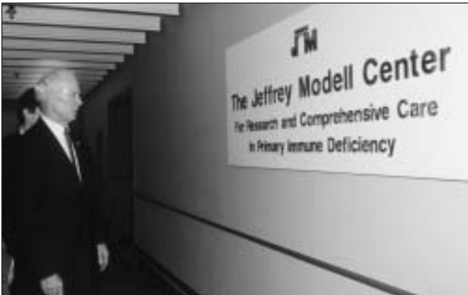
Rep. John Porter (R-IL) visits the JMF Center at Mount Sinai