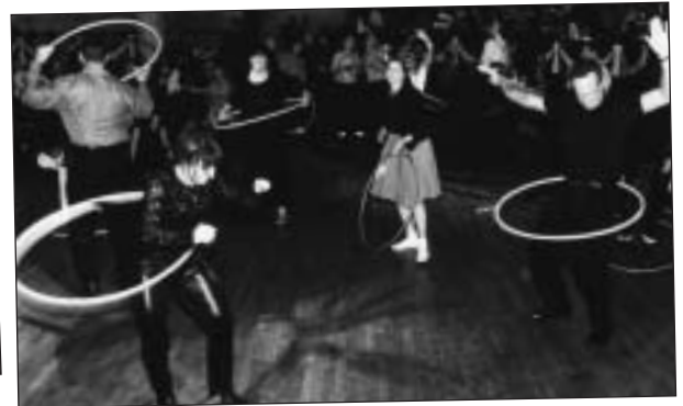
Hula Hoop contest challenges the crowd