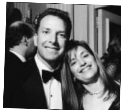
(L-R) Mr. & Mrs. Steven Witkoff, The Witkoff Group