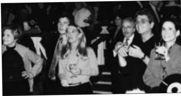
The crowd was entertained throughout the night