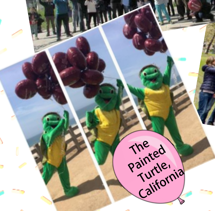
The Painted Turtle, California