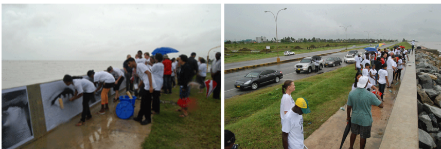
Youths show their concern about domestic violence

Manickchand explained that the concept of the August 2011 exercise was to draw attention to the fact that children are witnesses to everything happening around them, and adults must therefore behave in a way that would best positively influence children. Adult men must therefore realise that if they are going to beat up their wives, the children are watching, believing this to be normal behaviour.