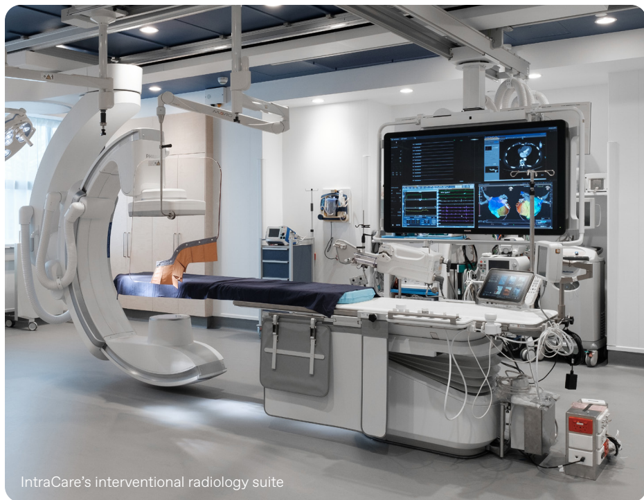
IntraCare's interventional radiology suite