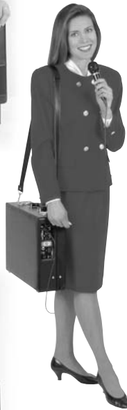
TOUR GUIDE Audible Mobility, even Outdoors!