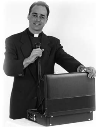
SERMON OR PRESENTATION Command a Presence behind the Lectern