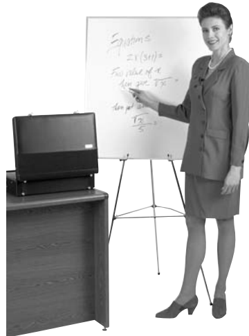
TEACHER IN CLASS Unrestricted Mobility with Wireless Tie-Clip Mic