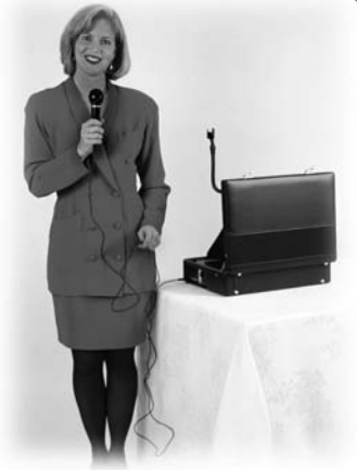
TRADE SHOW OR GROUP SALES Communicate and Demonstrate effectively