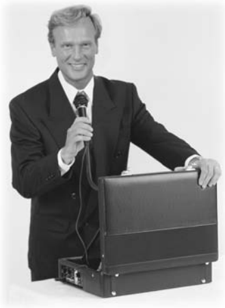
CONFERENCE OR SEMINAR Perfect for the Medium Sized Audience