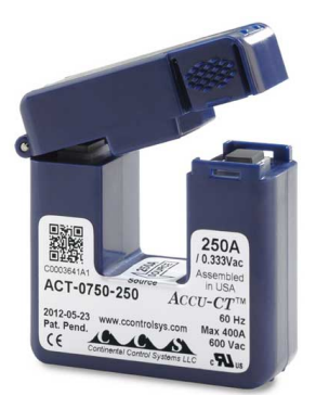
CSS Accu-CT Split-Core Current Transformer