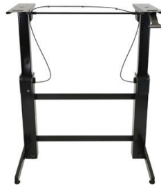
WorkFit-B Sit-Stand Base HD