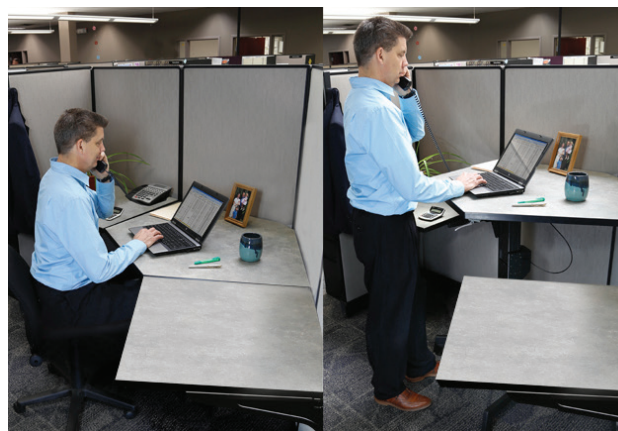
Sit-stand office cube with WorkFit-B LD installation using existing worksurface

Features up to 20 inches (51 cm) of vertical motion—patented CF technology allows instantaneous, tool-free, non-motorized re-positioning while you work! Integrated brake secures table in place and with just a touch releases for height adjustment.