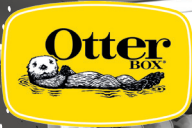
Accommodates the Otterbox Defender Series case with cover!