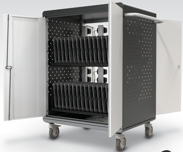
Plastic dividers include cable management channels and cable wraps.