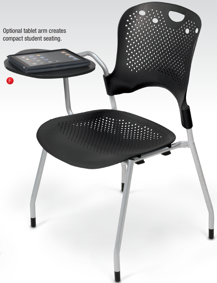
Optional tablet arm creates compact student seating.