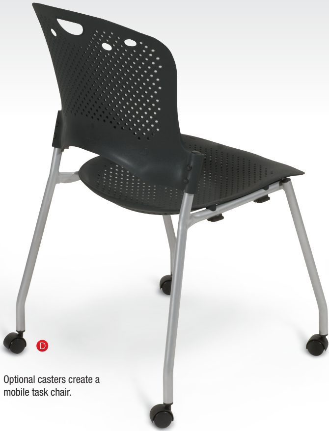
Optional casters create a mobile task chair.