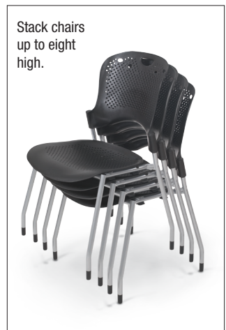
Stack chairs up to eight high.