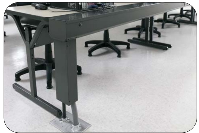
PowerBar Hardwired System