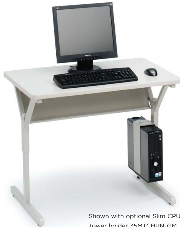
Shown with optional Slim CPU Tower holder 35MTCHRN-GM

205 Westwood Ave, Long Branch, NJ 07740 Phone: 866-94 BOARDS (26273) / (732)-222-1511 Fax: (732)-222-7088 | E-mail: sales@touchboards.com