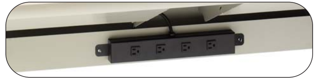
Fluid Down Power System