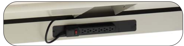
ECF6 Power Strip