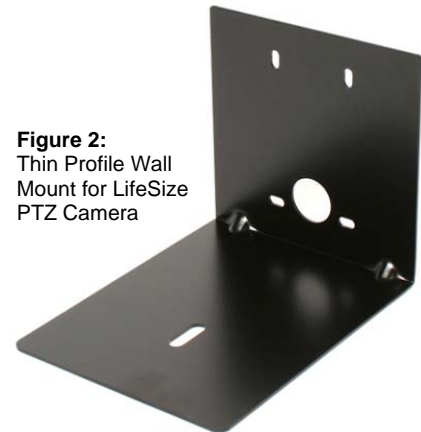
Figure 2: Thin Profile Wall Mount for LifeSize PTZ Camera

Please see the Vaddio website at http://www.vaddio.com for the Vaddio Statement of Warranty for all Vaddio Products. The Statement of Warranty covers the policies and procedures of the Hardware Warranty, Exclusions, Customer Service, Technical Support, Return Material Authorizations (RMA), Voided Warranty, Shipping and Handling and Products Not Under Warranty. The Vaddio Warranty Statement supercedes all other published warranty statements in content and coverages. Vaddio Technical Support can be contacted through the Vaddio website or through e-mail support at mailto:support@vaddio.com .