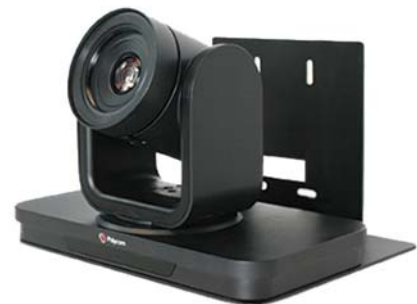
EagleEye IV Camera on Wall Mount. (Camera not included with wall mount.)

205 Westwood Ave, Long Branch, NJ 07740 Phone: 866-94 BOARDS (26273) / (732)-222-1511 Fax: (732)-222-7088 | E-mail: sales@touchboards.com