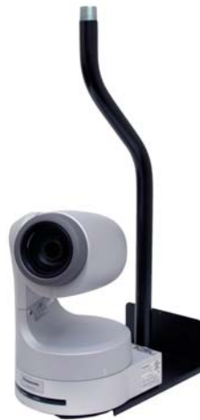
535-2000-295 For Panasonic Camera