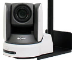
535-2000-294 For Sony BRC Series Cameras