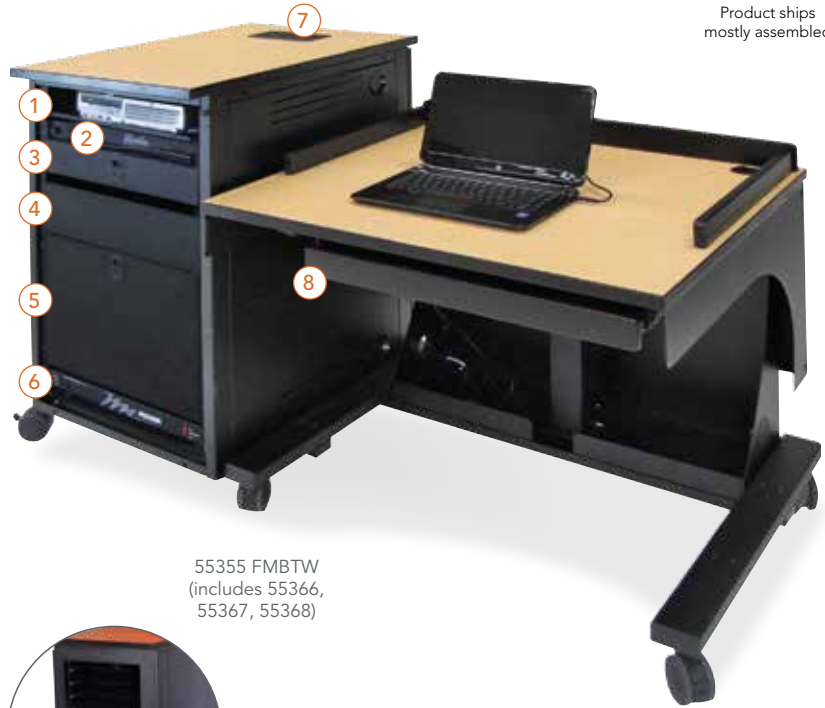
55355 FMBTW (includes 55366, 55367, 55368)