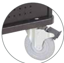
5" BALLOON WHEELS