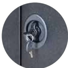
DOUBLE-BOLT KEYED SECURITY LOCK