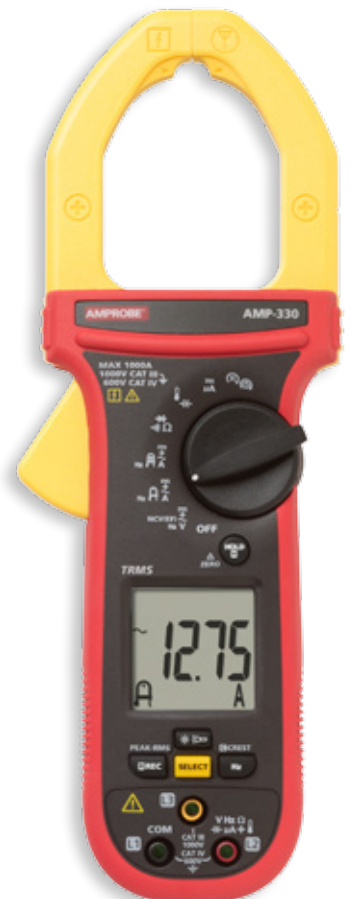
AMP-330 AC/DC 1000 A Clamp Meter Industrial Motor Maintenance