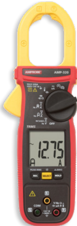
AMP-320 AC/DC Clamp Meter Electrical Motor Maintenance