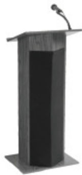
MODEL #111 PLS