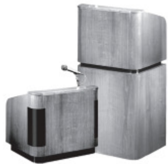
MODEL # 950/901/910