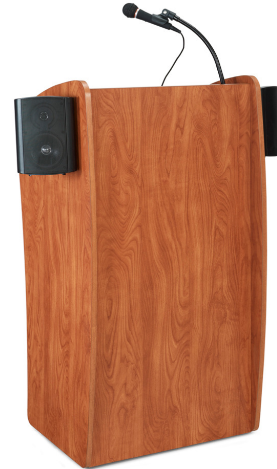
MODEL # SK