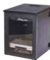
29" H Equipment Rack consisting of 68107 B and 68200 I

COMBINE THE ROBUST STEEL FRAME WITH AN ATTRACTIVE LAMINATED SURFACE FOR AN ATTRACTIVE AND VERSATILE RACK CABINET