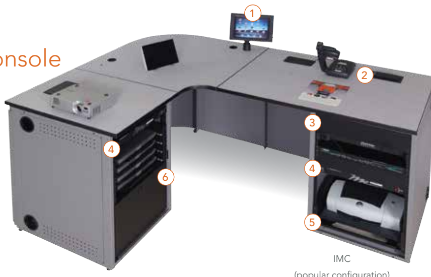
IMC (popular configuration)