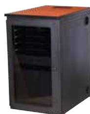
36" H Equipment Rack consisting of 68157 B and 68200 CH