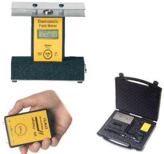
EFM51.CPS Charge Plate Kit

This document is prepared for our customers as a service, and is to the best of our knowledge true and accurate. However, it is understood and agreed by the users of this document that we will accept no liability for the conclusions reached. Users of this document may therefore wish to perform additional testing before determining that products mentioned are suitable.