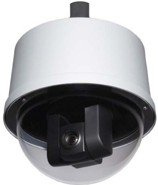
12" Indoor Pendant Mount Dome (with Clear Optical-Grade Dome (shown with 1.5" NPT Pipe and HD-18 Camera - Not Included)

The DomeVIEW HD Series Domes are an excellent way to securely mount the HD-20, HD-19 or HD-18 PTZ cameras for a wide range of HD video applications.