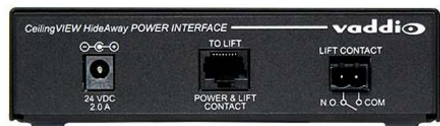
Figure 2: Vaddio CeilingVIEW HideAway Power Interface

The CeilingVIEW HideAway Power Interface uses one (1) Cat-5e cable to the CeilingVIEW HD HideAway enclosure to provide power to the motorized lift and send a lift control signal to raise and lower the lift.