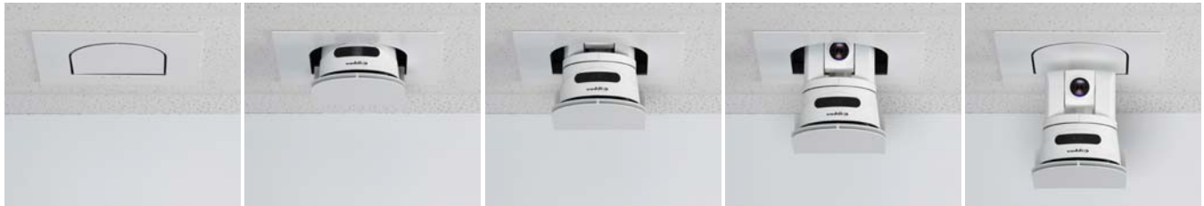
Figure 1: Vaddio CeilingVIEW HD HideAway System with a Vaddio ClearVIEW HD-18AW Camera

The Vaddio CeilingVIEW HD HideAway is a ceiling mounted motorized camera lift system that provides the ability to quietly lower a Vaddio ClearVIEW HD PTZ camera from the ceiling, retract it back into the ceiling and completely hide the camera. It is ideal for use in classrooms, boardrooms, presentation environments, video conferencing and training facilities.