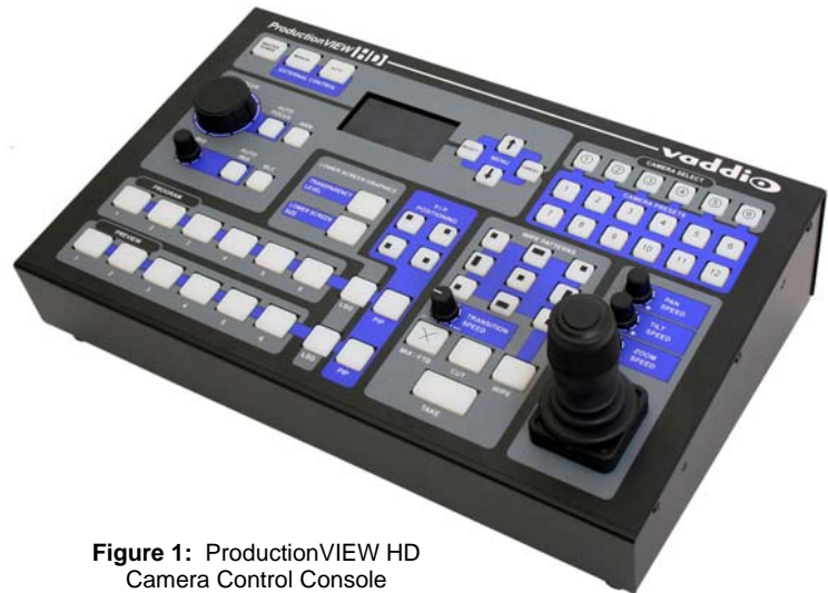
Figure 1: ProductionVIEW HD Camera Control Console

In our relentless drive to redefine camera control, Vaddio introduces the ProductionVIEW HD multi-camera control system. Designed to handle the most demanding live broadcast or staging events, it's still simple enough to allow a novice to shoot like a pro. ProductionVIEW HD integrates PTZ camera control and multi-format HD/SD live switching with real-time graphics and effects into one easy-to-use control console.