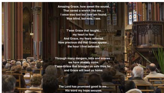
Lower Screen Graphic covering one-half of the screen, with a transparency level of 75%

Amazing Grace, how sweet the sound, That saved a wretch like me, I once was lost but now am found, Was blind, but now I see.